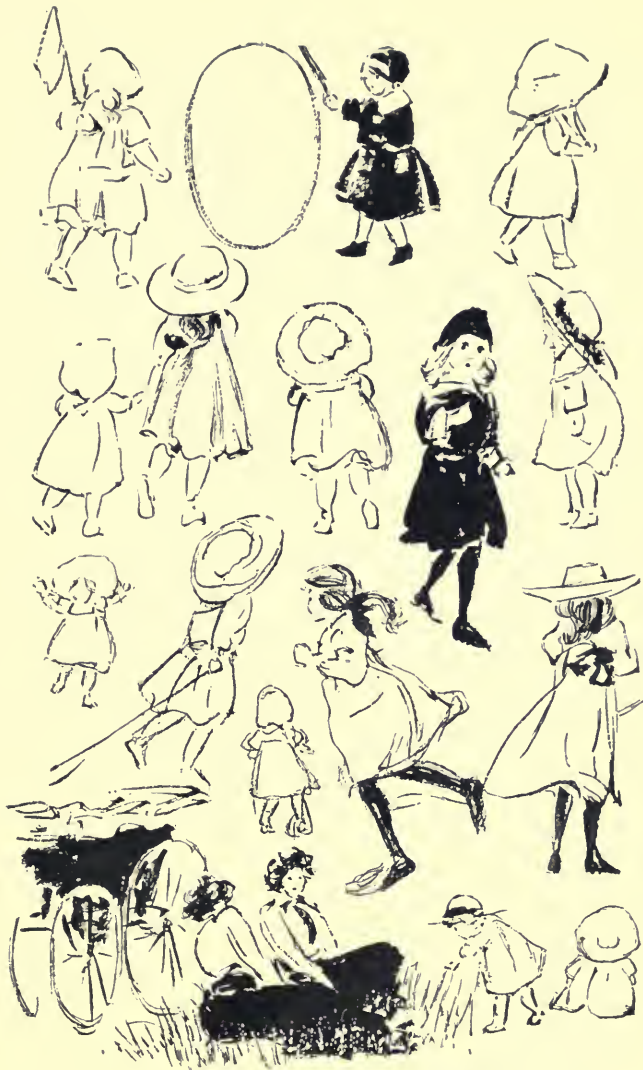
at Kensington Gardens